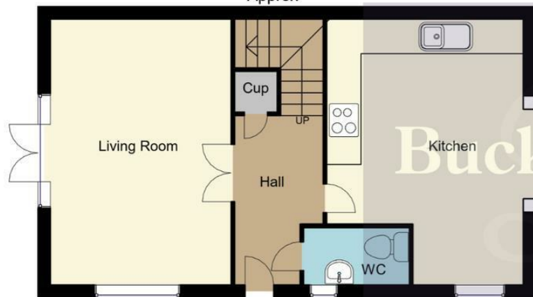
Ground Floor 46sq.m/491.65sq.ft Approx